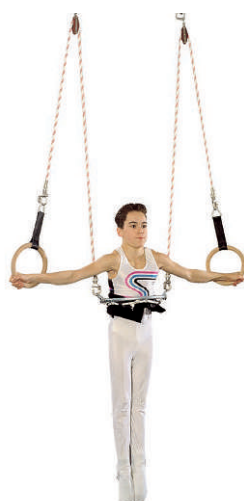
Fifty-fifty equipment 1403250