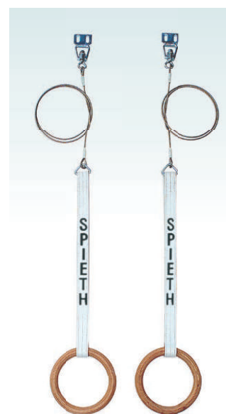
Ceiling ringset 1289000