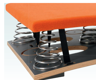
Low noise springboard.