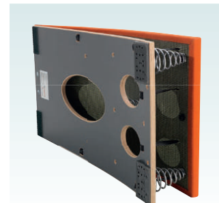
New high quality springs.