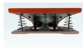
Improved dynamic properties over the entire surface.